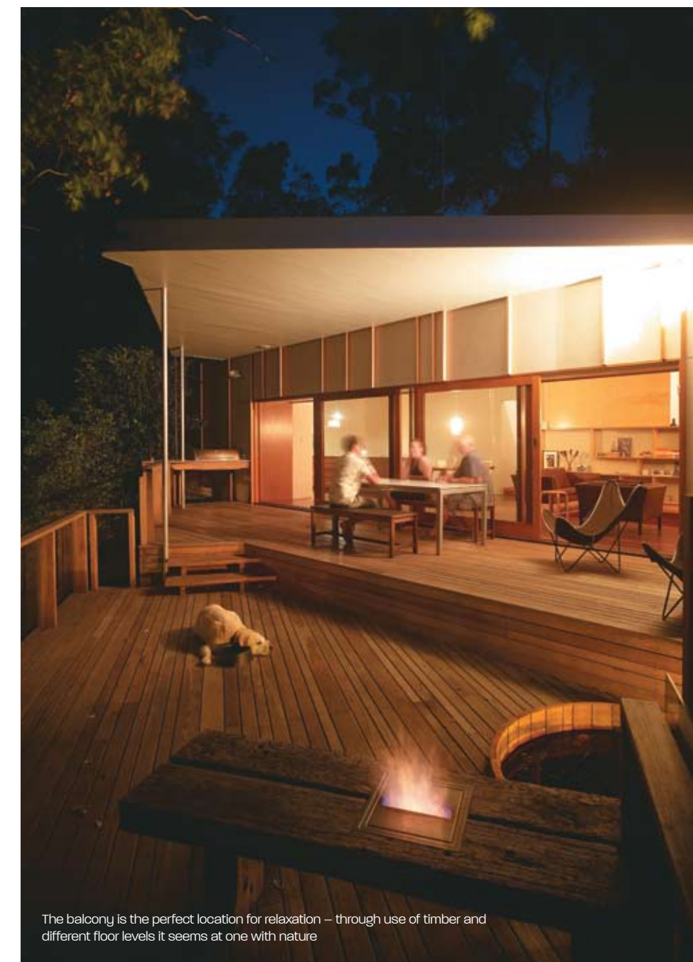
The balcony is the perfect location for relaxation — through use of timber and different floor levels it seems at one with nature