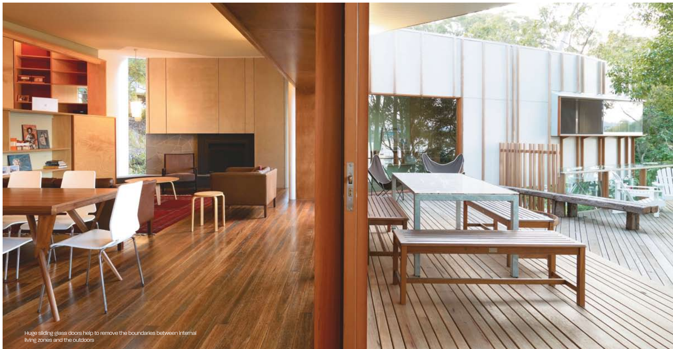
Huge sliding glass doors help to remove the boundaries between internal living zones and the outdoors

This home is perhaps modest in size and expenditure, but it is certainly rich with texture, form and embodied cultural references.