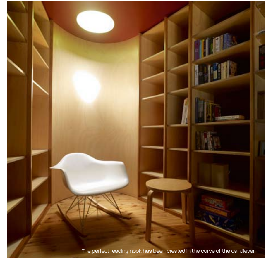
The perfect reading nook has been created in the curve of the cantilever